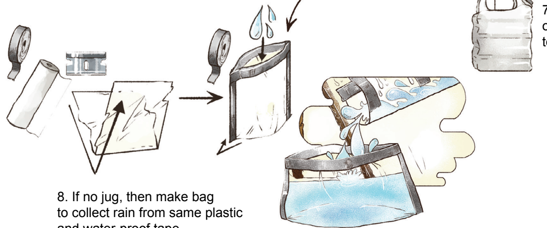
7. Use jug or container to collect rain