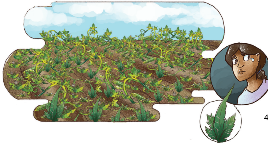
4. Create holes to insert vegetable seeds