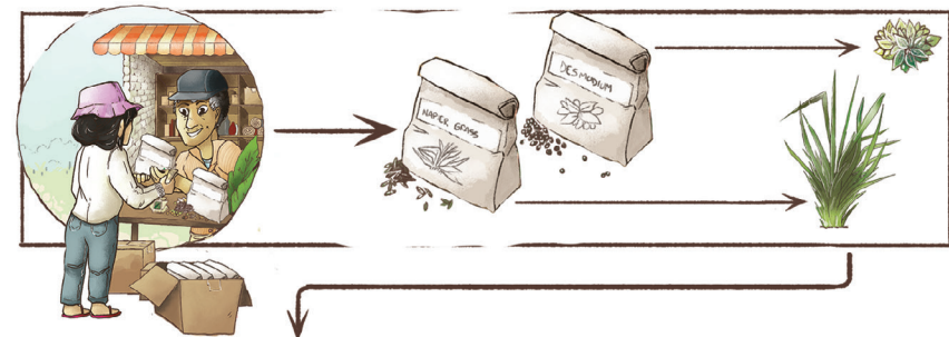
3. Intercrop with Desmodium