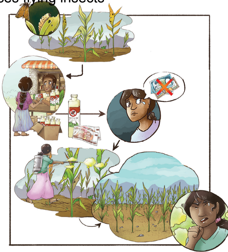
1. Traditional practice: expensive pesticides are purchased from vendor and sprayed

2. Improved practice: purchase Desmodium and Napier grass seed from vendor