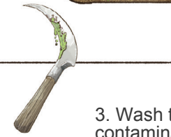
3. Wash the cutting knife as it may be contaminated with disease or pest