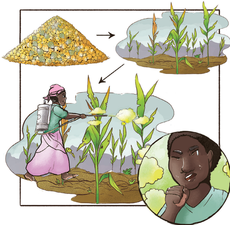
1. Traditional practice