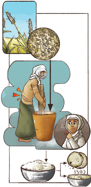
1. Traditional practice