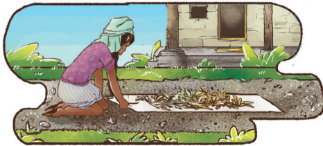
2. Improved practice using car trampling