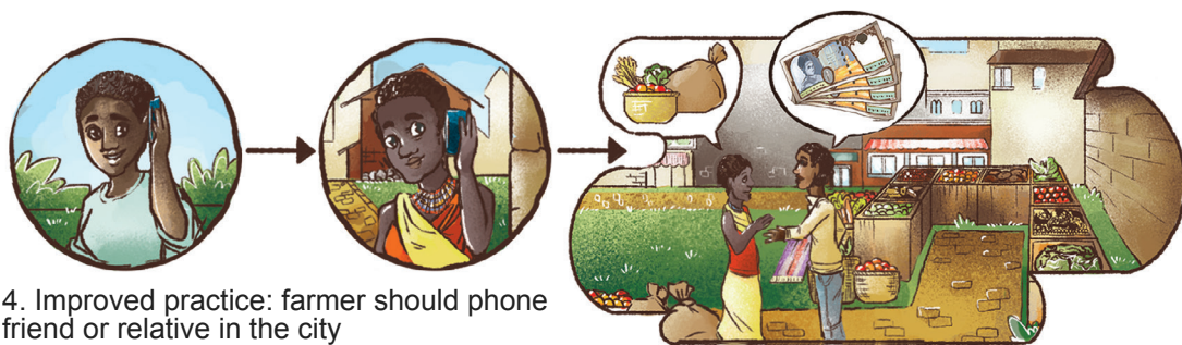
4. Improved practice: farmer should phone friend or relative in the city