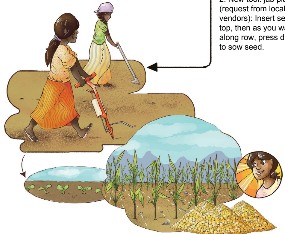
3. Single person can use