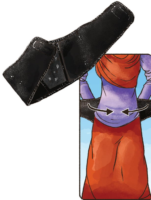
3. Improved practice: purchase a back support from vendor and tie around waist (on top or under clothes)