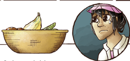
3. Low yield