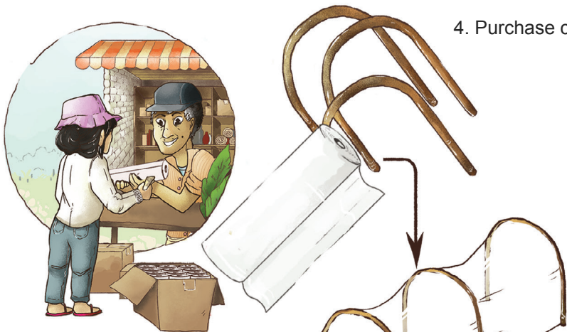
4. Purchase clear tarpaulin from vendor