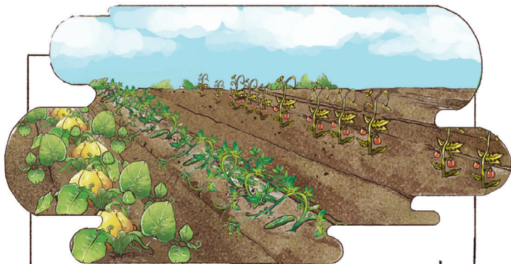
1. Traditional practice: vegetables uncovered