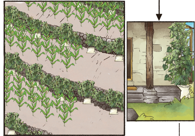
3. New practice: place yam seed in bag with soil