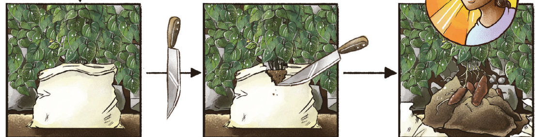
5. Easy to harvest yam from bags