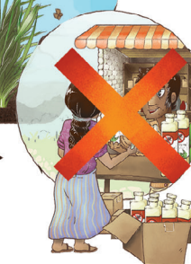
6. Less need to purchase pesticides