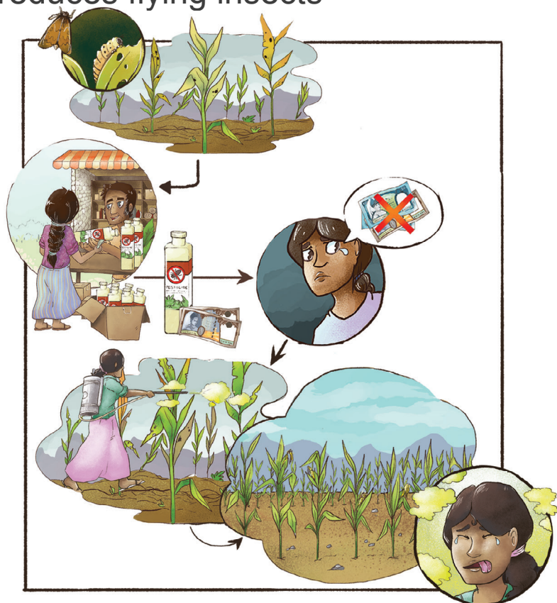
1. Traditional practice: expensive pesticides are purchased from vendor and sprayed

2. Improved practice: purchase Desmodium and Napier grass seed from vendor