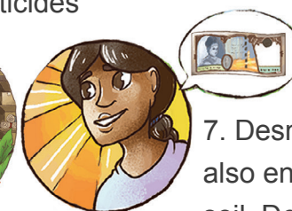
7. Desmodium also enriches soil. Desmodium and Napier are also livestock feeds.