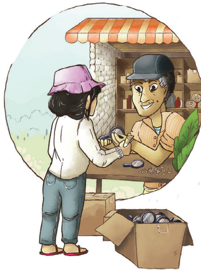
2. Purchase magnifying glass/sheet from vendor