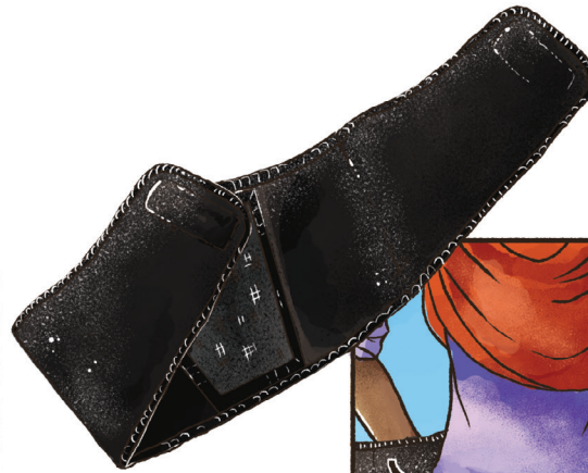
3. Improved practice: purchase a back support from vendor and tie around waist (on top or under clothes)