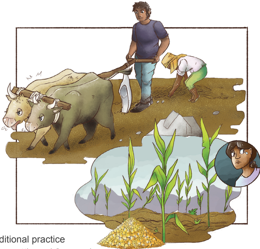
1. Traditional practice requires cattle and 2+ people. Difficult on steep hillside or narrow terrace.