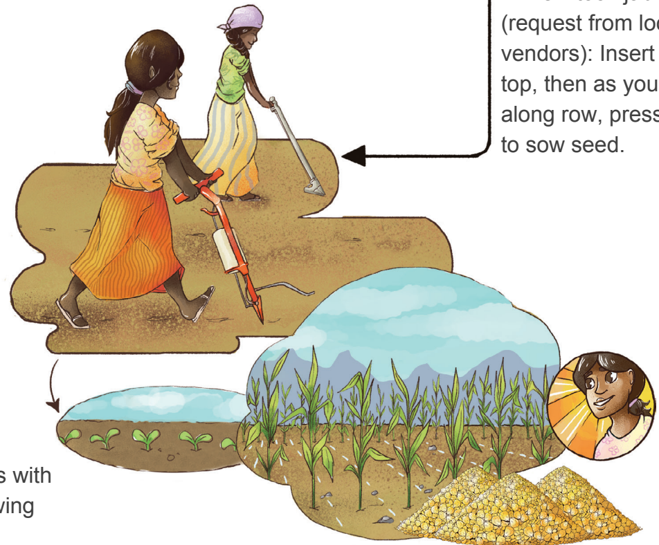
3. Single person can use